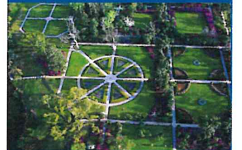
Visit Middleton Place and Gardens