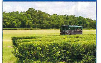
Tour Charleston Tea Gardens