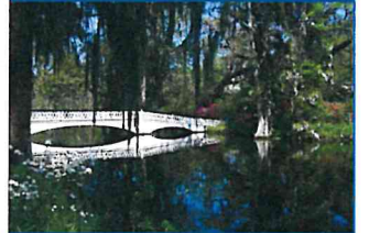
Take in the Picturesque Views of Charleston

Day 7: Enjoy a Continental Breakfast before departing for home... a perfect time to chat with your friends about all the fun things you've done, the great sights you've seen and where your next group trip will take you!