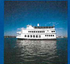
Cruise Around Charleston Harbor